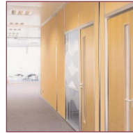
Solid Partition Options